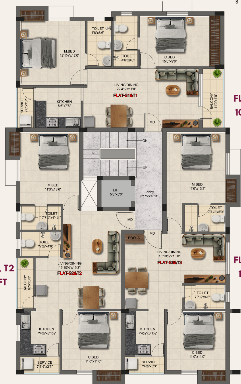
FLAT - S3, T3 1012 SQFT