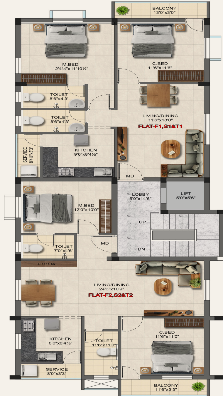
FLAT - F1, S1, T1 1057 SQFT