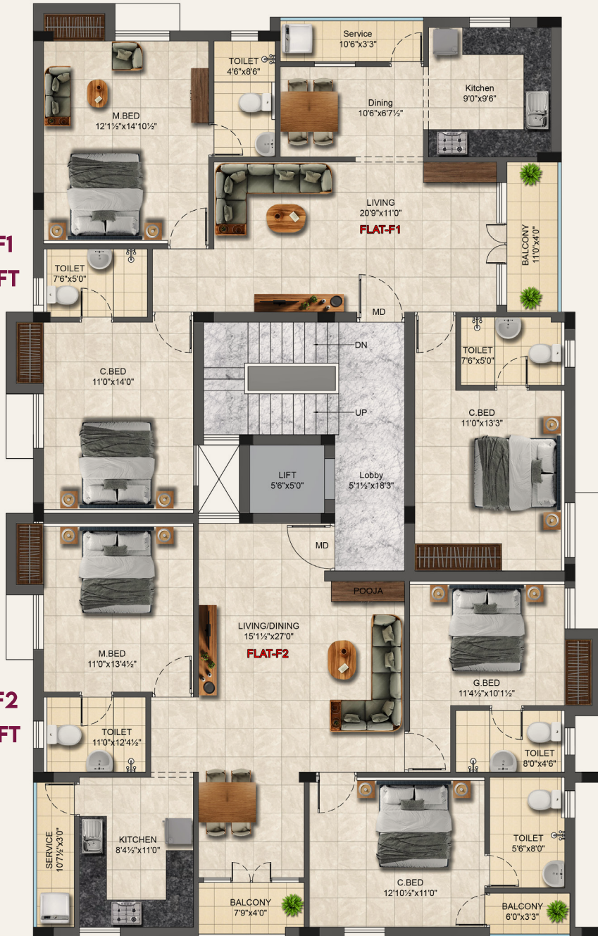
FLAT - F2 1526 SQFT