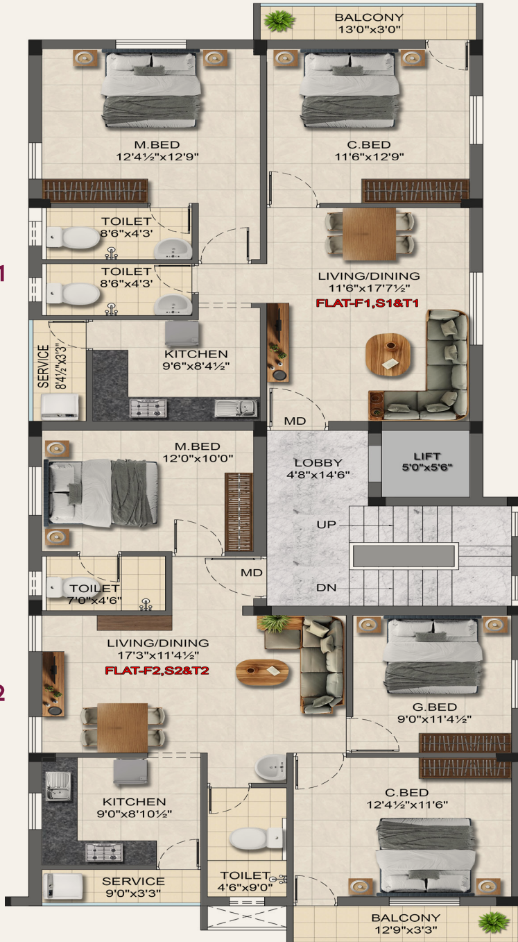
FLAT - F2, S2, T2 1176 SQFT