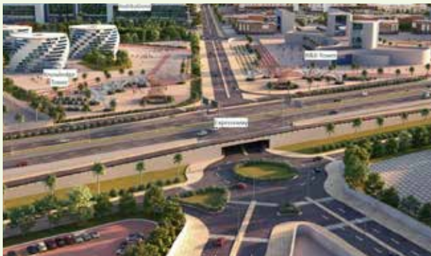
Knowledge City Thiruvallur