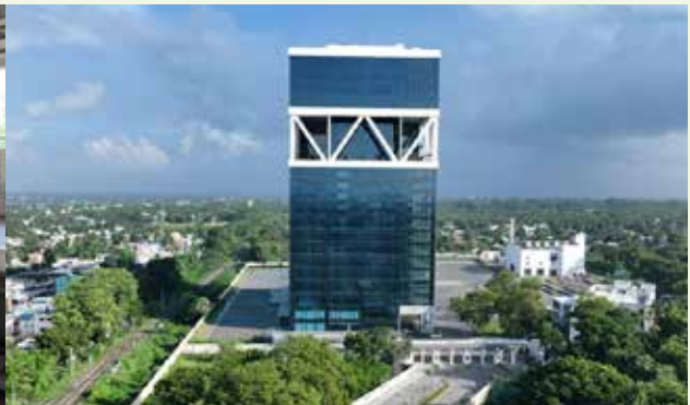
Tidel Park Pattabiram