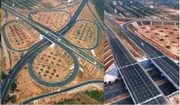
Chennai - Bangalore Expressway