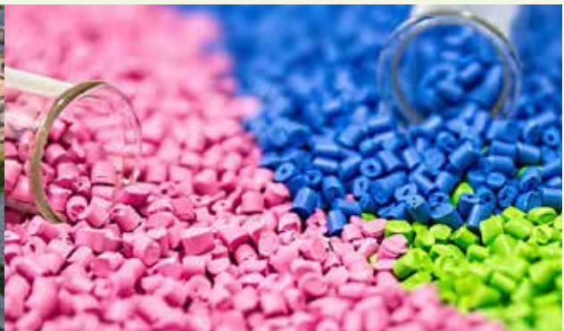
Tamilnadu Polumer Industries Park, Thiruvallur