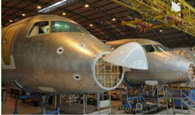
Aerospace Hub Sriperumpudur