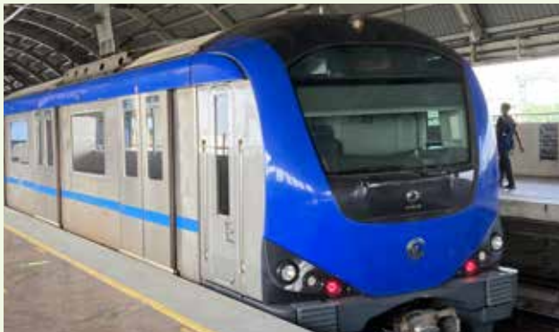
Koyembedu Pattabiram Metro Train